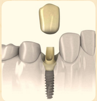
Implant and Crown