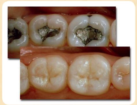
Silver vs. Composite Fillings